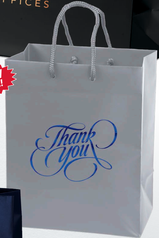
BERLIN FOIL PRINT