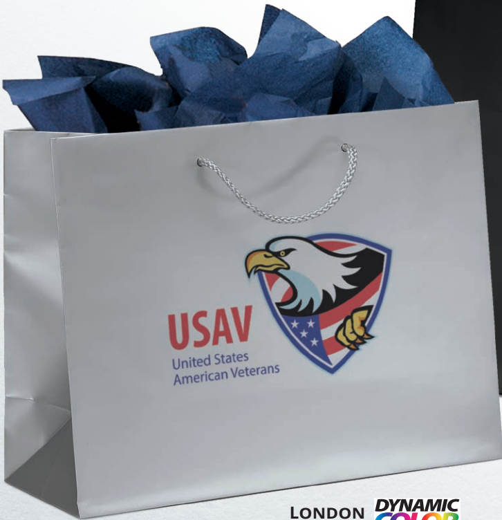
LONDON DYNAMIC COLOR

Matte-laminated Eurototes include macramé handles, a reinforced fold-over top, and a cardboard bottom insert.