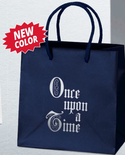
DUBLIN FOIL PRINT