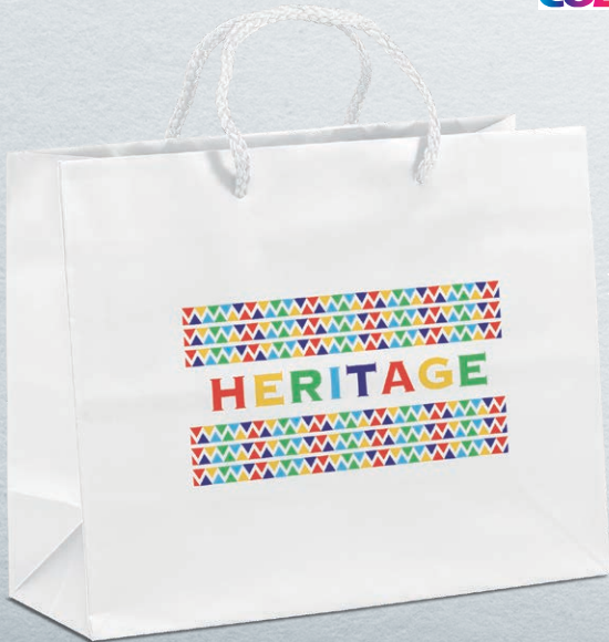
PARIS DYNAMIC COLOR